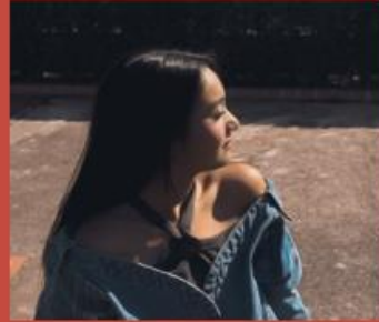
I can't live without my phone